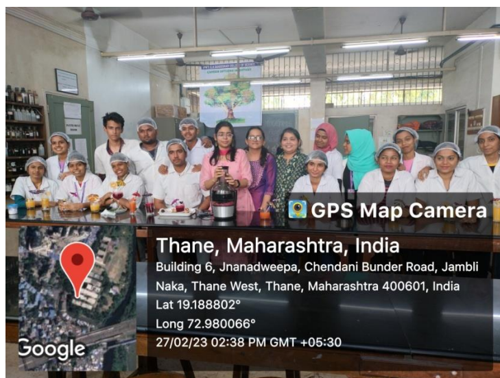
Students during practicals and theory

Graphical Representation of Feedback: The overall feedback is excellent.